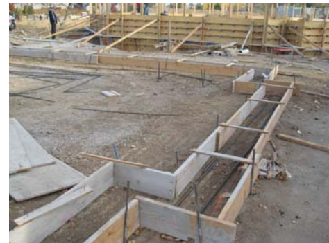
FIG. 2: UPPER GARAGE FOOTING FORMS AND REINFORCING

If you have any questions or comments, please feel free to call.